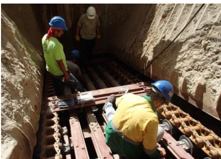
Honduras – Cementos del Norte