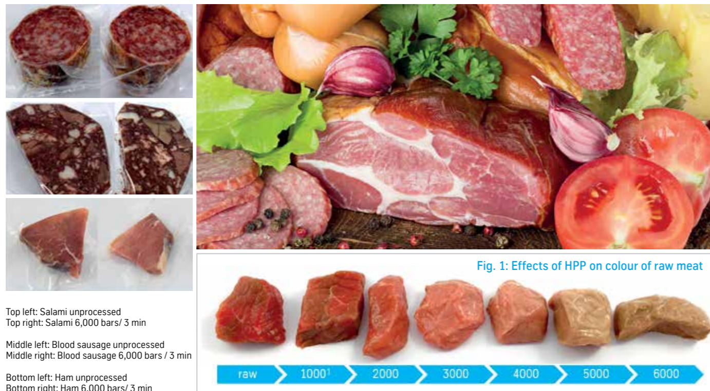
Fig. 1: Effects of HPP on colour of raw meat

The HPP processing is optimally appropriate for the extension of shelf life of sausage and ham; thus, it is made sure that detrimental